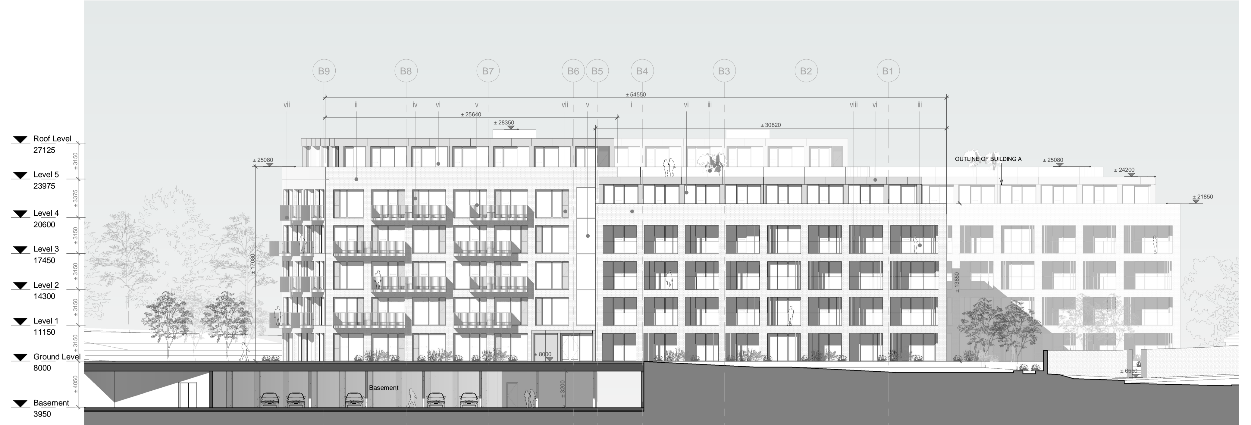
2 Building B - East Elevation scale 1 : 200