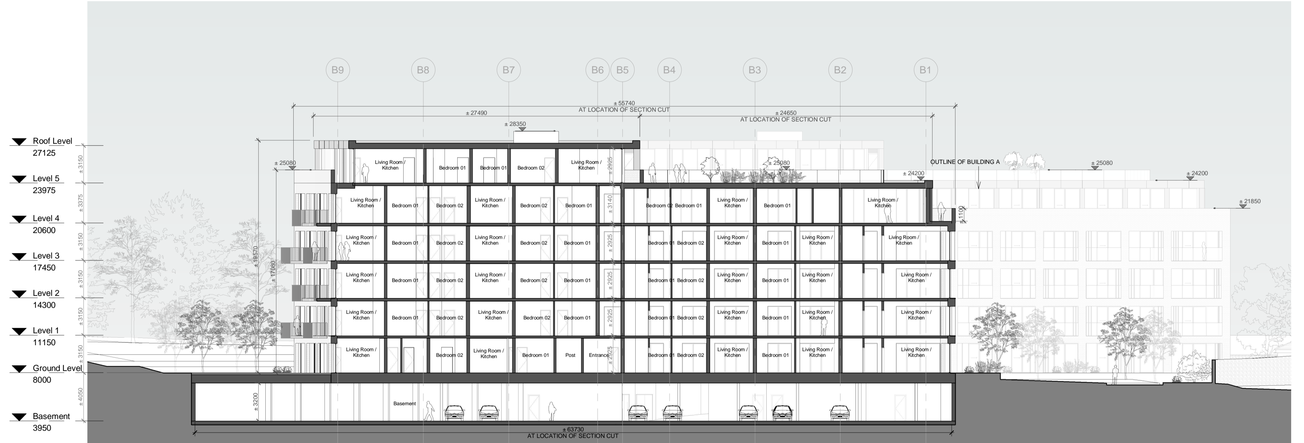
4 Building B - Section BB scale 1 : 200